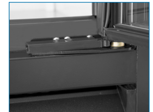
Robust door hinge