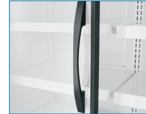
Sleek rounded door handles