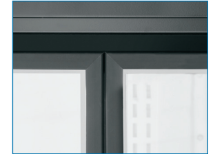
Low profile swing doors with no center mullion