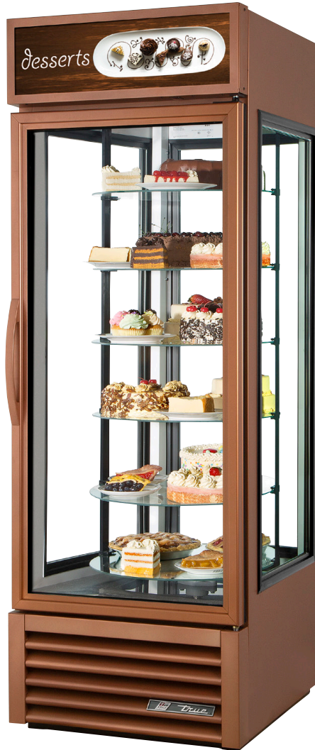
Shown with optional Dessert Sign.

Swing Door Rotating Glass Shelf Refrigerator~True Standard Look Version 01